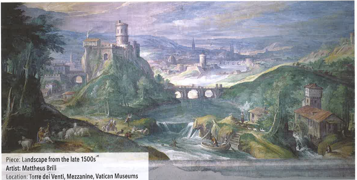
Piece: Landscape from the late 1500s sm Artist: Mattheus Brill Location: Torre dei Venti, Mezzanine, Vatican Museums

How does our Lord want to see fruit and growth in your life? Have I squandered God's harvest in my life?