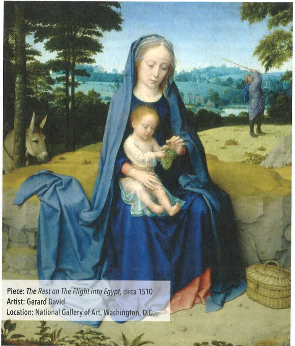
Piece: The Rest on The Flight into Egypt , circa 1510 Artist: Gerard David Location: National Gallery of Art, Washington, D.C.

God loves us so much, like a mother loves her child. He provides for all his creatures, even for the lily that only blooms for a day. He knows everything