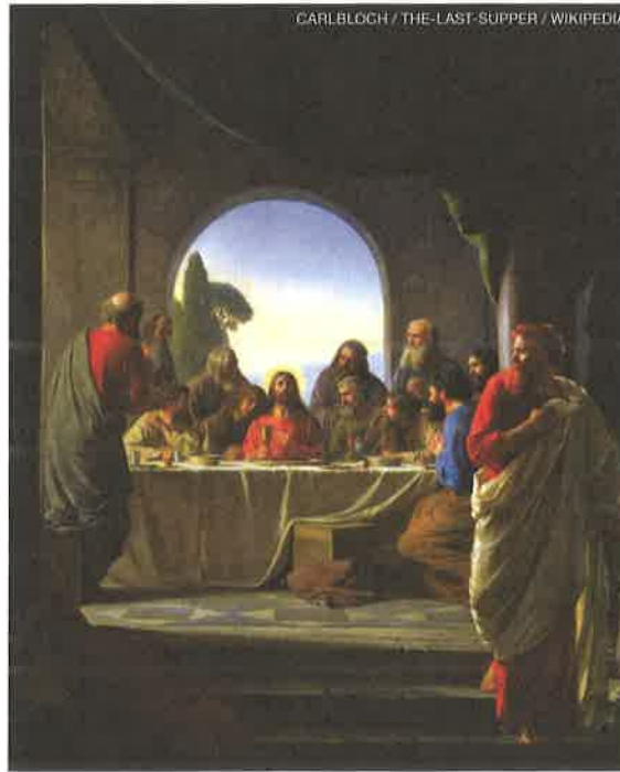
CARLBLOCH / THE-LAST-SUPPER