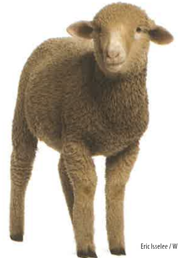
Eric Isselee / Wikipedia